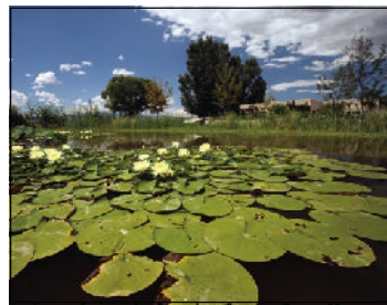
A pond near the Dancing Cranes Guest House, of Wendy's Farm Road, just north of Hwy 380 on Farm to Market.