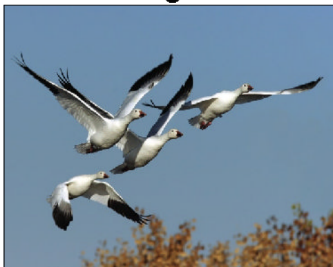
Snow Geese at the Bosque

San Antonio fits no secret that the Rio Grande Valley especially in the autumn, is prime birders and photographers paradise. The changing seasons turn the fields and bosques into harvest reds and golds, and brings an abundance of birds and the people who watch and photograph them.